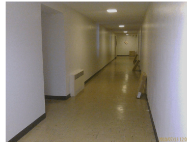
Before new lighting.

Thanks for all your flexibility this summer while construction has been taking place! We invite you to visit the second floor of the education wing to see the work that has been taking place in the hallways. New lighting, new wall surfaces - and now that the walls have been "furred in" we will begin the work of designing and painting murals that will make our education floor fun and welcoming for our children. Stay tuned for further developments!