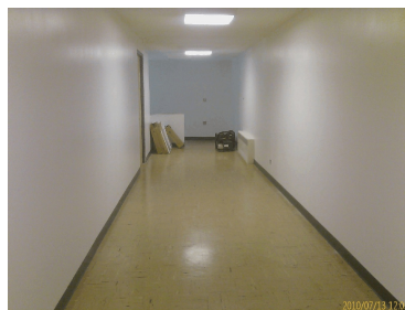
After new lighting.